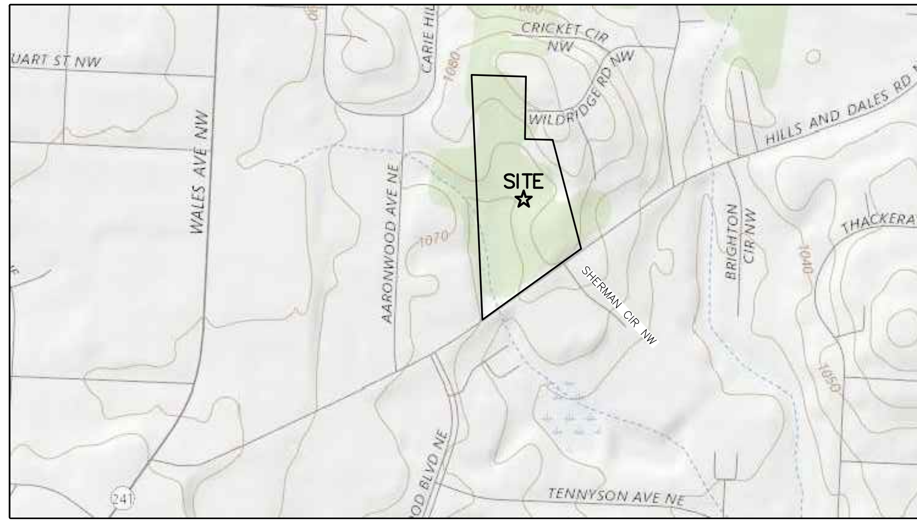
SITE ADDRESS: INTERSECTION OF HILLS & DALES ROAD NE AND SHERMAN CIRCLE NE, MASSILLON, OH 44646