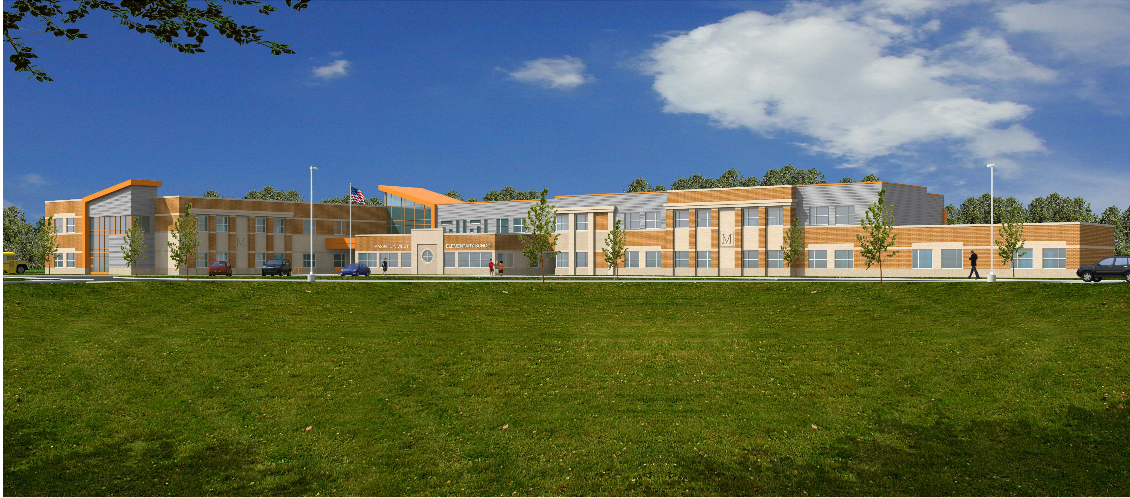
VOLUME 2 OF 2